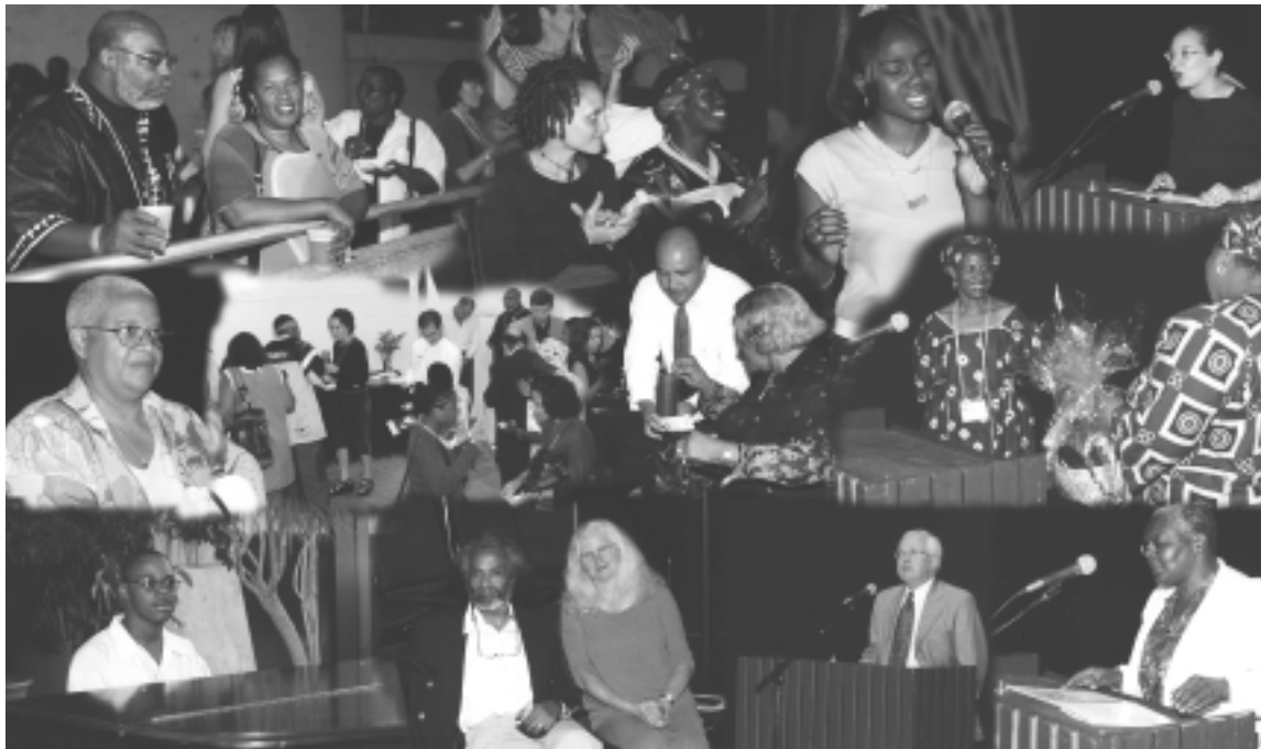
Black Body: Race, Resistance, Response Opening August 6 th , 2001